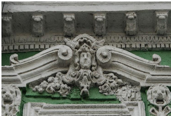
Fig. 10. Mercury on the facade of the house

Symbol interpretation: According to legend, while walking in the forest, Mercury saw two snakes fighting and inserted a stick between them to reconcile them. The snakes calmly wrapped themselves around it on both sides.