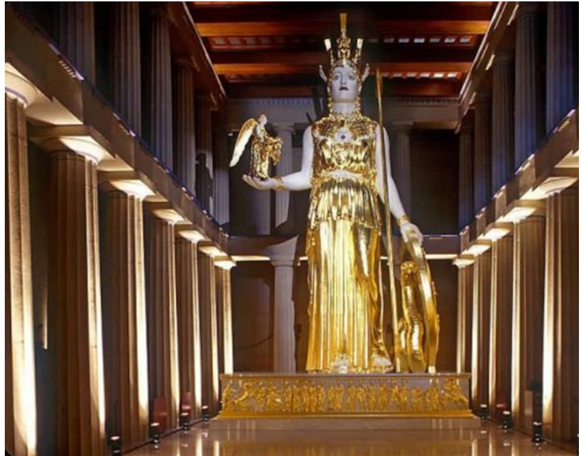
Fig. 6. Athena Parthenos - the Virgin Goddess. Sculptor Phidias. 460 BC

Few monuments have survived from the Homeric period because the main building materials were wood and unfired bricks. Monumental sculpture was also made of wood. The most striking monuments of this period are vases painted with geometric ornaments, as well as terracotta and bronze figurines.