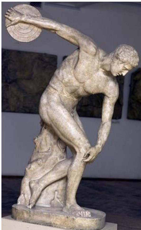
Fig. 3. Diskobol: a discus thrower. Sculptor Myron. Approximately 476 BC

throughout the Greek world, and some are concentrated in the Acropolis in Athens. Myron worked exclusively in bronze, with the exception of one statue of Hecate, which was carved in wood (Fig. 3, Fig. 4).