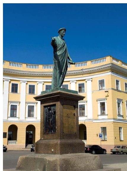
Fig. 8. Bas-relief Mercury on the monument to the Duke de Richelieu. Prymorskyi Boulevard. Odesa

Mercury was the god of commerce in ancient Greece. His symbol was a large purse, and he also had winged sandals, a traveling hat, a caduceus rod, and a money bag. Much later, Mercury took on a number of new and important functions: he became the patron saint of crafts and arts, and in the Middle Ages, he was the patron saint of alchemists, magicians, and astrologers.