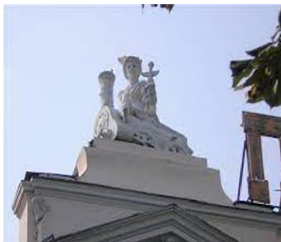
Fig. 9. Mercury on the steam locomotive Passage, Odesa

The image of Mercury on the Passage, the main shopping center of early twentieth-century Odesa, can be found in various guises. For example, the image of Mercury riding a steam locomotive, which symbolizes technological progress (Fig. 9, Fig. 10). Mercury can be seen on the facade of the building at 39 Bunina Street. Shops were located in this building (fig. 10).