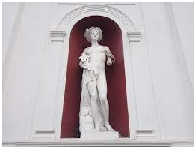
Fig. 7. Mercury on the facade of the Old Merchant Exchange building. Odesa

There are quite a few images of Mercury in Odesa. For example, the ensemble on Dumska Square, on the facade of the Old Merchant Exchange building, which was built in 1820 (Fig. 1). There is a bas-relief of Mercury on the monument to the Duke de Richelieu, located on Prymorskyi Boulevard (Fig. 7, Fig. 8).