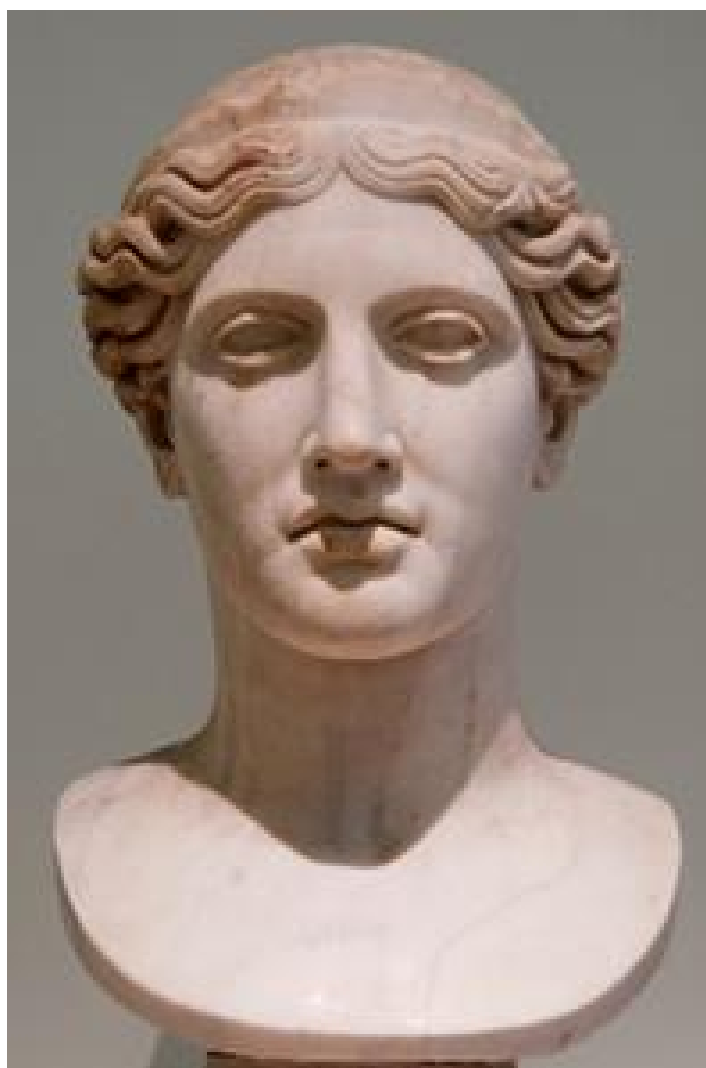
Fig. 2. Bust of Artemis. Sculptor Polycletus. 5th century BC

A talented sculptor, Myron was born in Eluterus, a small town on the ancient borders of Boeotia and Attica. He lived most of his life in Athens. Little is known about his life, and what we do know comes from ancient literary sources, primarily from the 1st century writer Pliny. According to Pliny, Myron absorbed the art of sculpture from Agelades of Argos, the same teacher who taught Phidias (488-431 BC) and Polycletus (5th century BC). Pliny wrote that Myron was the first to achieve life-like representations in figurative sculpture. No matter how correct this statement is, we can say that Myron mastered his craft and was gifted with the ability to create movement, harmony, and naturalism [2].