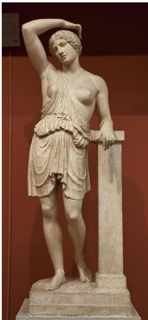
Fig. 1. The wounded Amazon. Sculptor Polycletus. Roman copy of the Greek bronze original, 430 BC Height 198 cm

historical authenticity and mythological idealization are combined in Polycletus' works so organically that their true themes are sometimes unclear (some scholars tend to see Achilles in Doriphorus and Apollo or Paris in the Diadumenes). Polycletus had numerous students and followers up to the Roman era, including his teacher Lysippus (Fig. 1).