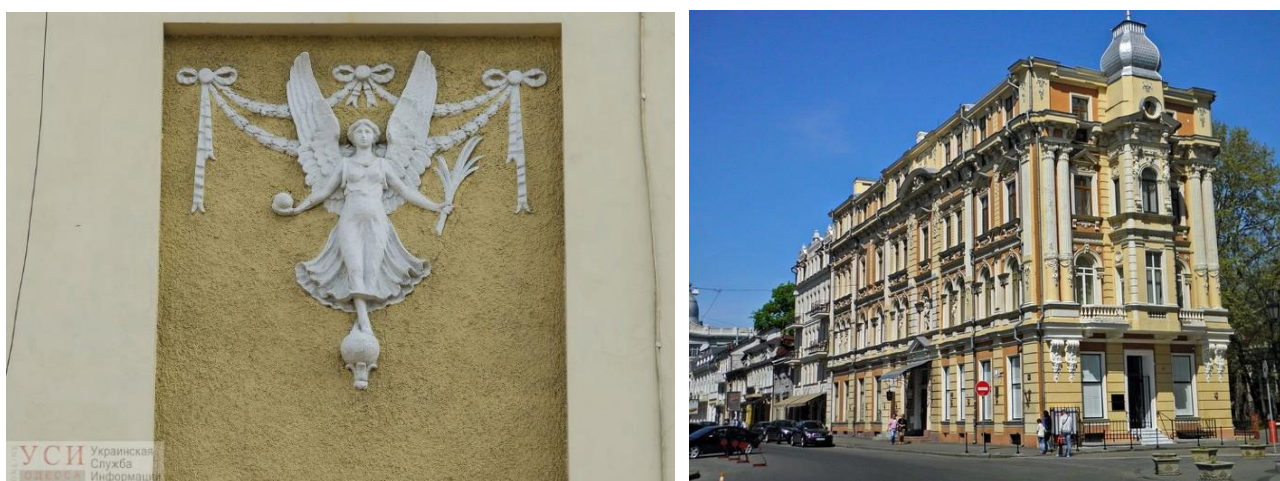
Fig. 11. A bright symbol - the Goddess Fortuna. Vasyl Navrotskyi's house, 8 Lanzheronivska Street

Mercury's neighbor was Fortuna. The goddess was responsible for good luck, without which trade is hard to imagine. The classic image is on a ball or wheel, often blindfolded and with a horn of plenty. Again, the best place to spot good luck is the Passage, where there is an image of the goddess herself with a jug of gold coins and her symbols woven into the cartouches and column capitals. The most prominent image of Fortuna is her sculpture on the roof of the building, which is in harmony with Mercury sitting on a steam locomotive.