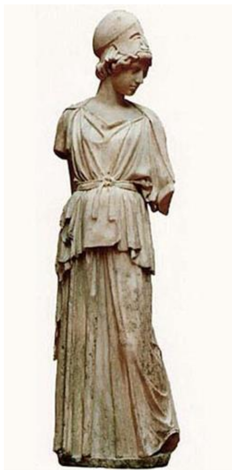
Fig. 4. "Athena". Sculptor Myron. City gallery. Frankfurt am Main. Approximately 456 BC

Phidias was born in Athens before 480 BC. He was one of the most gifted masters of ancient Greek art of the High Classical period. His father's name was Harmid. This name was once engraved on the pedestal of the sculpture of the god Zeus in Olympia ("Phidias, son of Harmid, created me").